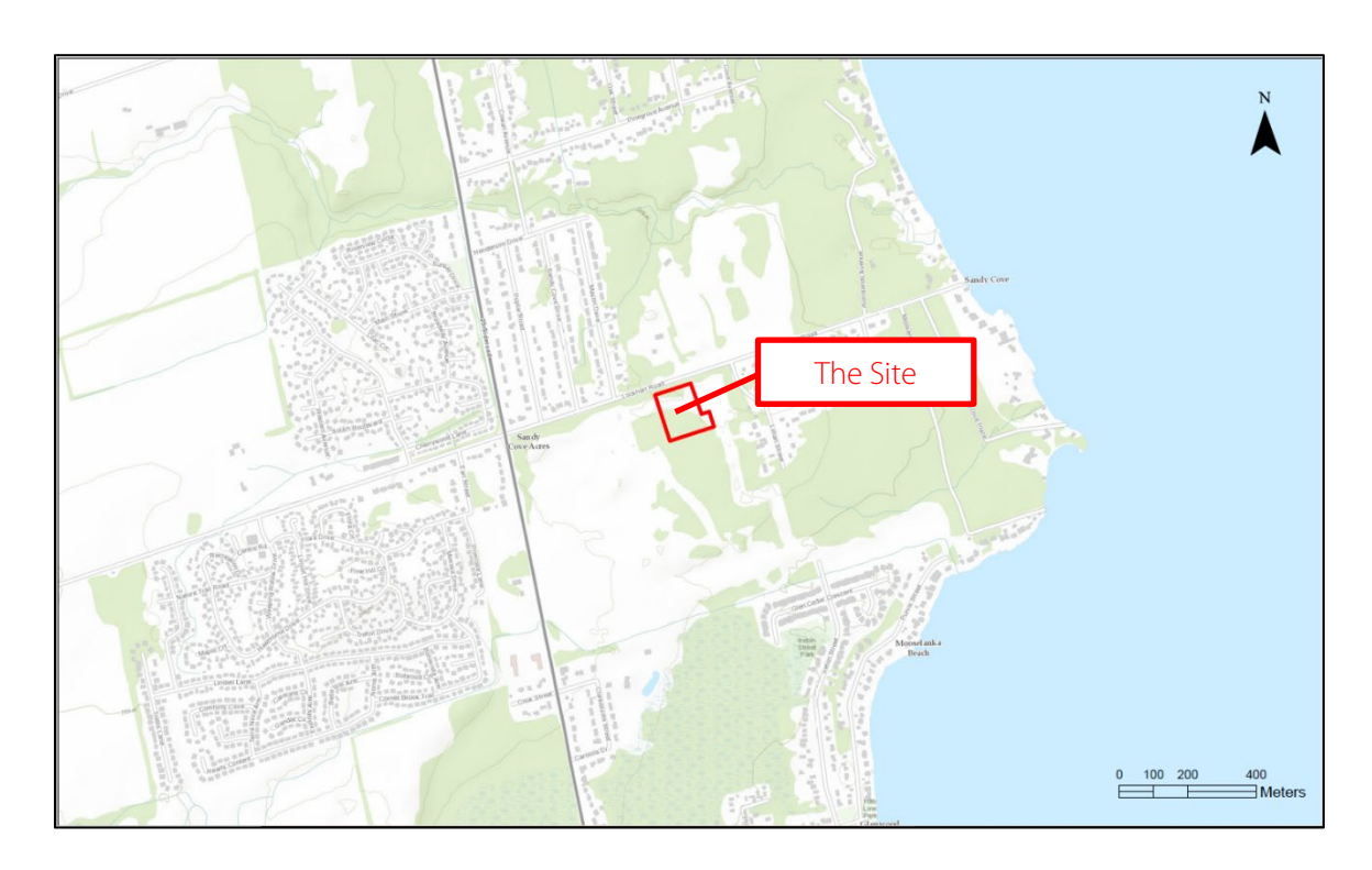
Figure 1 – Site Location