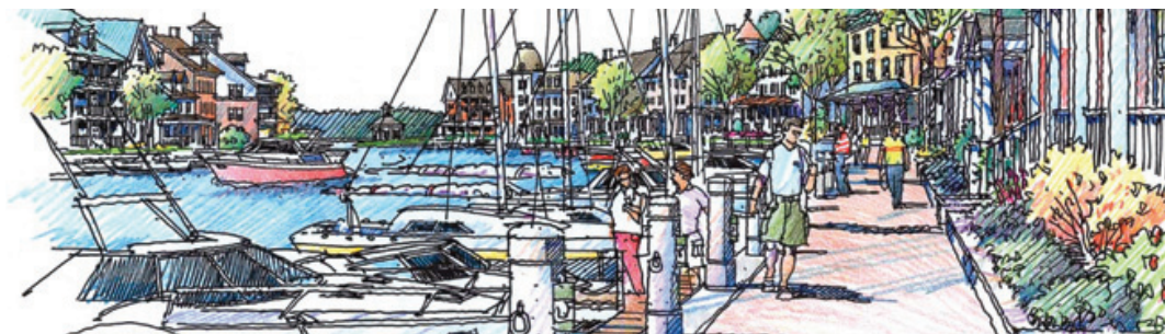
Concept view of the future marina

To compensate for the removal of trees on the site, a significant amount of reforestation will take place both on and off site in accordance with the approval documents, as approved by the Lake Simcoe Region Conservation Authority and the Town.